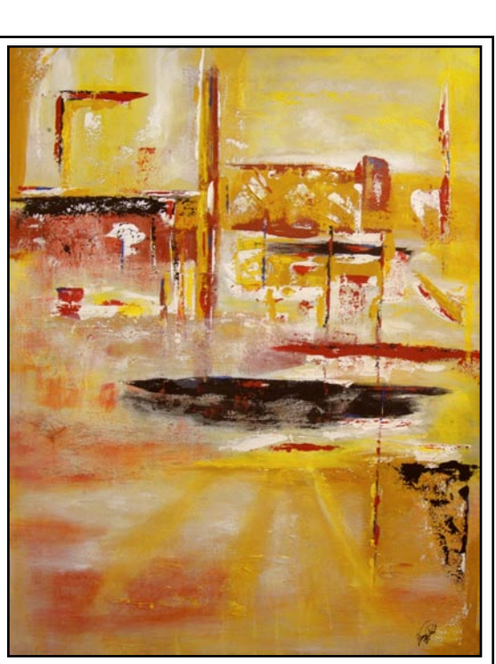
Jerry Peel, acrylic on canvas

Each masterwork by Young is preceded 4433 or visit (<u>www.morris-whiteside.com</u>).