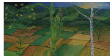
work by Trena McNabb

Jack Hernon's large and boldly colorful abstract acrylic mixed media paintings invoke a feeling of motion and excitement. The Winston-Salem, NC, artist's images invite expansion of perception in the minds of the viewers.