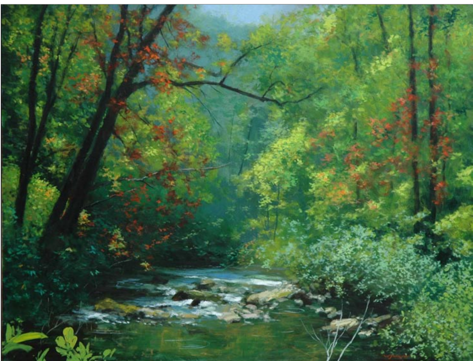
on the Chattooga River

The deadline each month to submit articles, photos and ads is the 24th of the month prior to the next issue. This will be Feb. 24th for the March 2012 issue and Mar. 24 for the April 2012 issue. After that, it's too late unless your exhibit runs into the next month