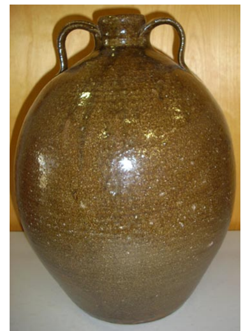
Unsigned, marked "V" from the Catawba Valley Region