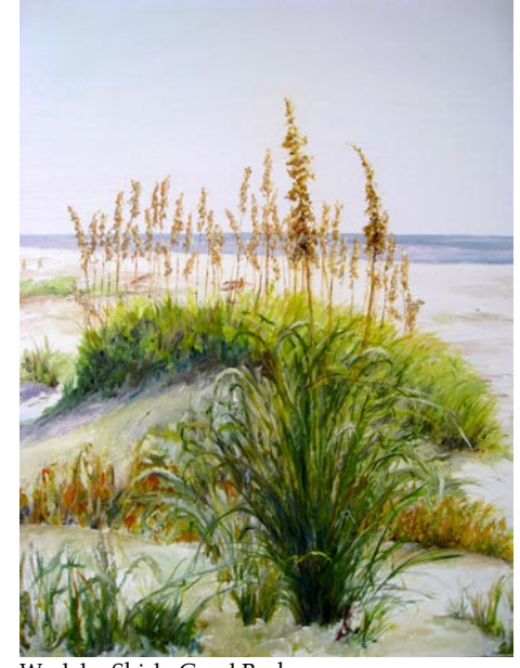
Work by Shirly Good Bacher

Bacher currently works primarily in pastel and oil in a style she calls "contemporary representational impressionism," as she says "not meant to be a fancy term, just de-