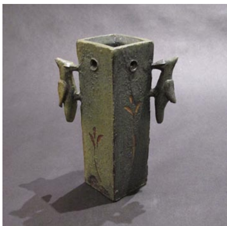
Work by Shawn Ireland

Now in its sixteenth year, American Folk Art will present its Annual Miniature Show this month featuring 12 of the gallery’s artists. With winter’s chill taking hold during February, The Miniature Show , timed to align with Valentine’s Day, is a much anticipated and heart-warming event. To be included, the artworks must be smaller than 9 x 7 inches. The challenge for the artists is to create a whole emotional world within that size limit.