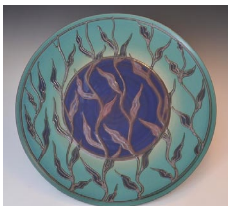
Work by Doug Dacey

in a retrofitted public-school building situated adjacent to Harmon Field parks and recreational lands and the Pacolet River. The school is host to an artisan retail shop, gallery, 200-object Heritage Collection, and seven independent studios, covering a range of media – Blacksmithing, Clay, Enameling, Fiber, Glass, Silversmithing, Welding, and Wood.