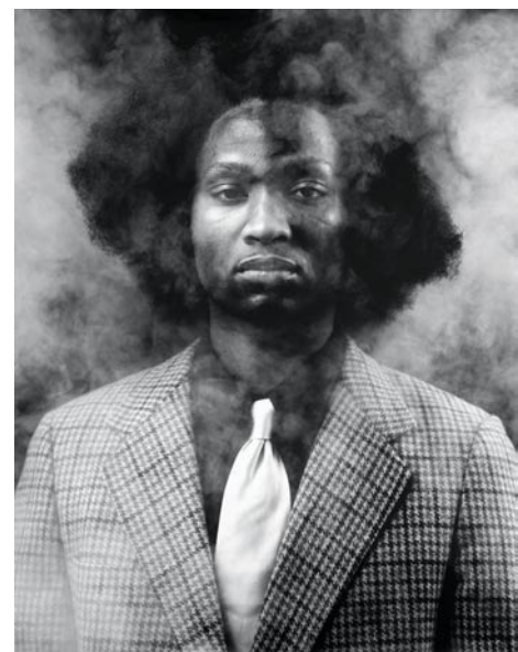
Work by Rashid Johnson