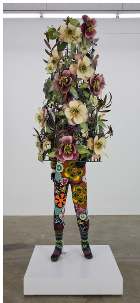
Work by Nick Cave

For further information check our NC Institutional Gallery listings, call the Museum at 919/839-6262 or visit ( http://ncartmuseum.org ).