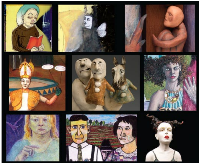
Images from postcard promoting StoryMakers