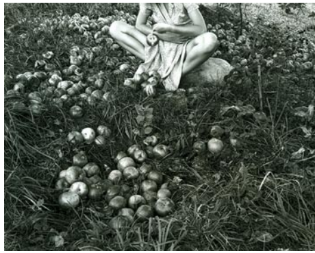
Self Portrait Picking Apples, Bolton, MA. Toned Silver Gelatin Print.