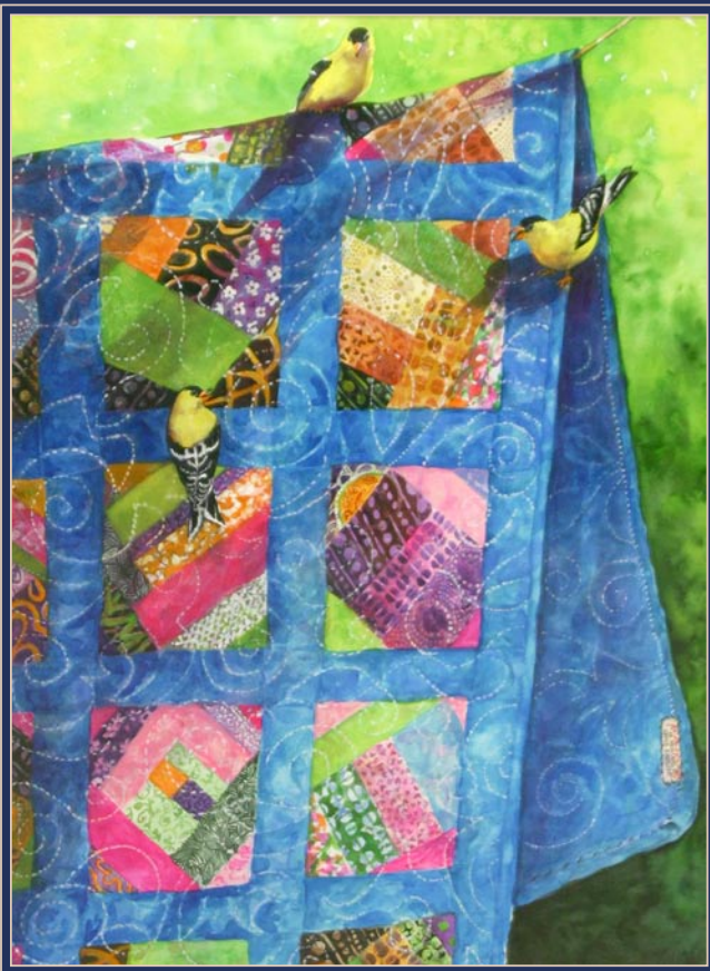
Conversation Quilt, by Lynda English

Don't see anything here about your exhibit or art space? Did you send it to us? The deadline each month to submit articles, photos and ads is the 24th of the month prior to the next issue. This will be Mar. 24th for the April 2013 issue and Apr. 24 for the May 2013 issue. After that, it's too late unless your exhibit runs into the next month. But don't wait for the last minute - send your info now. And where do you send that info? E-mail to ( info@carolinaarts.com ).