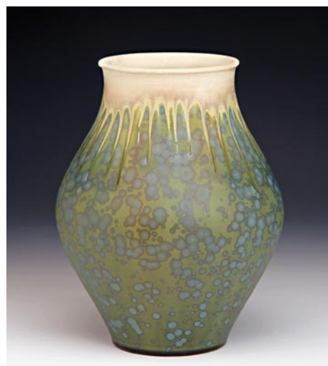
Work from Bulldog Pottery