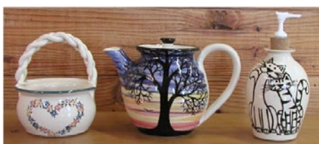
Works from Kovack Pottery

The wheels are whirring in Seagrove, NC, as potters get ready for their spring events and kiln openings. To kick off the season, the Kovack Pottery Spring Event is March 9-17. The nine-day event will feature a huge selection of wheel thrown, hand painted, numbered, limited edition pottery.