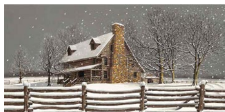
Work by Bob Timberlake