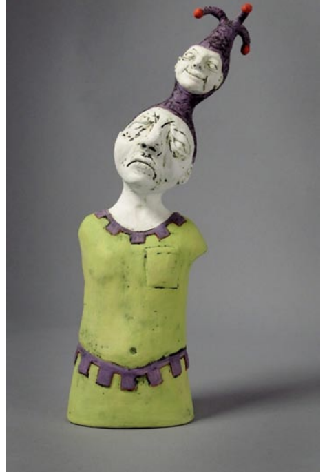
Work by Renee Rouillier

Alicia Leeke Fine Art Studio, 3821 Edinburg Rd., Columbia. Ongoing - Featuring original acrylic cityscapes, abstracts, monotypes, and drawings on canvas and fiber. Giclee's on canvas and paper also available. Hours: by appt. only. Contact: 803/429-5456 or at (www.alicialeeke.com).