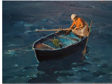
Work by Donald Weber

Italian Sojourn is a gondola ride slipping beneath bridges, an early morning misty walk through Rome, a trek along the Cinque Terre. Glimpses of daily life are offered: a nun on a narrow street, a drift fisherman, bedding airing in a window.