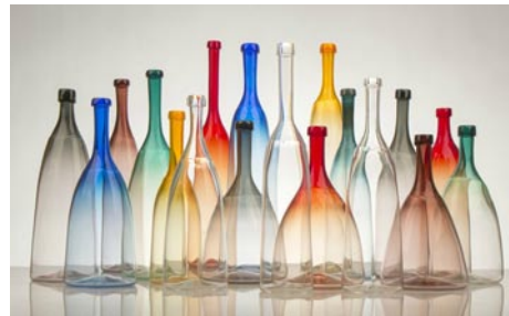
Works by Leckie Gassman

Ongoing - The former museum organization was founded twenty-five years ago in Seagrove, and is dedicated to preserving and perpetuating the pottery tradition. We strive to impart to new generations the history of traditional pottery and an appreciation for its simple and elegant beauty. A display of area pottery is now offered in the old Seagrove grocery building. Hours: Mon.-Sat., 9:30am-3:30pm. Contact: 336/873-7887.