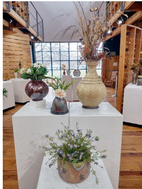
View of the "Flower Power II" exhibit

Ongoing - The Carolina Bronze Sculpture Garden is a natural and landscaped area overlooking a beautiful 1.25 acre pond. A walking trail loops around the pond with benches and a picnic area along the trail. The Sculpture Garden collection consists of donated and loaned sculptures from emerging and established artists working in all 3D media suitable for the outdoors. There are currently 19 sculptures installed around the pond. The landscaped and natural areas have a focus on NC native plants and trees. As an extension of this park, a sculpture is installed in the downtown area of Seagrove. Hours: Mon.-Fri., 8:30am-4pm. Contact: 336/873-8291 or at ( www.cbsculpturegarden.com ).