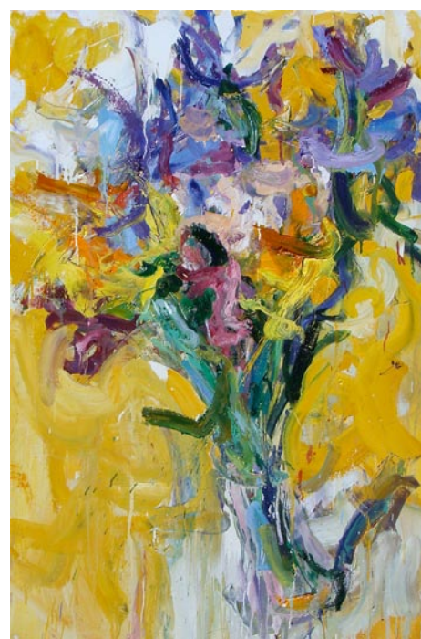
Work by Carl Plansky

Works on paper as well as oils on canvas from the artist's collection will be on display. "Carl's work is inspiring and continued above on next column to the right