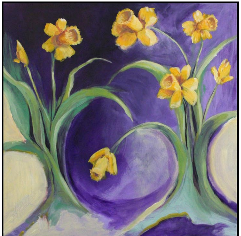
Daffodils Discussing the World Situation 36" x 36" acrylic on canvas

WWW.PROVIDENCEGALLERY.NET 601-A Providence Road (704) 333-4535 Charlotte, NC 28207