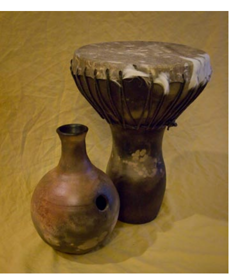
Work by Nathan Skinner

The Fine Arts League Gallery, 25 Rankin Ave., Asheville. Ongoing - Located within the Fine Arts League of Asheville, the Gallery is devoted to the development of realist artists and features figure drawings, portraits, landscapes and still lifes. Hours: Mon.-Fri., 10am-5pm or by appt. Contact: 828/252-5050 or at (www.fineartsleague.org).