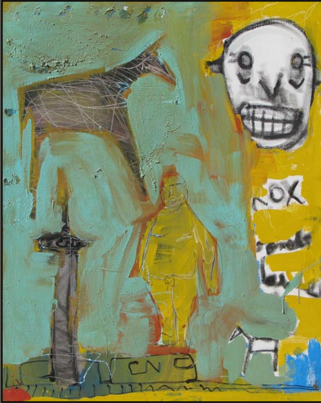
XONON Oil on Canvas 31 x 36 inches Casey McGlynn

EyeLevel Art and Artistic Spirit Gallery, in Charleston, SC, are collaborating on this Visionary art show offering the chance to collect “Outsider Art*” from nationally known artists.