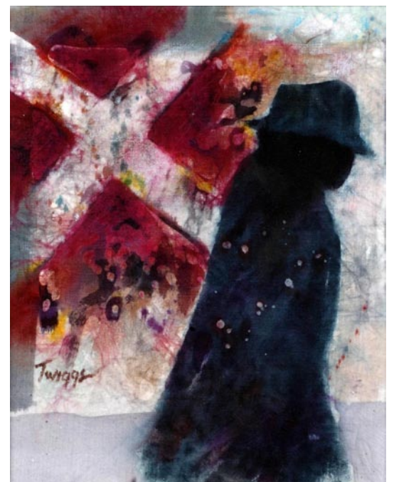
Work by Leo Twiggs

The City Gallery at Waterfront Park, owned by the City of Charleston and operated by the City of Charleston Office of Cultural Affairs, is a venue for