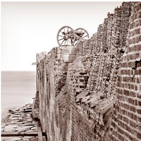
1865 Fort Sumter

Charleston in the immediate aftermath of the five-year conflict of the War Between the States. Many of Charleston’s well-known landmarks are documented in these images, including the Battery and City Hall, as well as images of the flag raising ceremony at Fort Sumter, which occurred near the end of the Civil War on Apr. 14, 1865, denoting the fourth anniversary of the surrender of Fort Sumter.