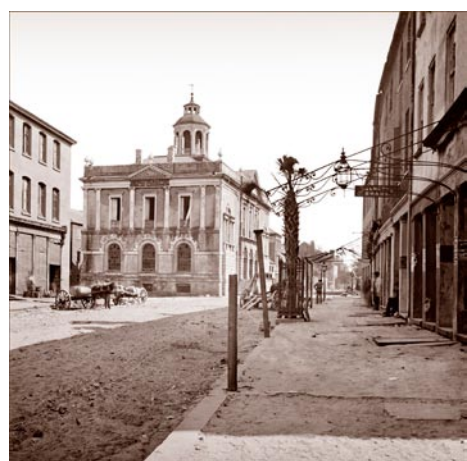
1865 Post Office

Some of these photographs were originally taken with large glass plates, while