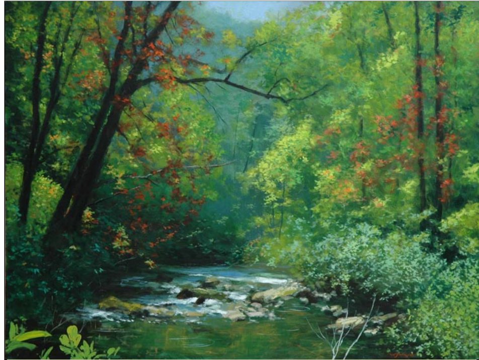
Late Summer on the Chattooga River

continued above on next column to the right