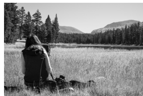
View from the Eastern Sierras trip

most revered photographers of all time. In short, Ansel Adams was a pioneer in the world of photography, specifically in landscape photography. Adams is revered for his complete dedication in every step of the photographic process and is known for his