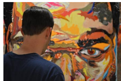
Viewing Art, photo by Richard Weaver

New for 2015 are several exciting events: Arts + Drafts, a celebration of the art of craft beer with live music by The Whiskey Rebellion out of Virginia, where visitors will be invited to sample several craft brews and browse the art market featuring a diverse selection of artwork from original work to prints; The Art of 'Que, an event showcasing the art of Southern BBQ featuring live music by popular Americana group, The Blue Dogs; several workshops and tours at Moore Farms Botanical Garden; Competition Artist Talks, where visitors can meet and mingle with competition artists and learn about their work; a public art installation at Moore Farms Botanical Garden by Charleston-based artist, Vassiliki Falkehag featuring sisal fiber and live