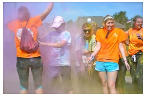
Color Me 5K run

Initially founded in 2013, ArtFields© annually transforms the historic district of Lake City into a Southern art mecca for nine days allowing visitors, residents, and artists to experience a massive arts festival in the heart of one of South Carolina's most charming small towns.