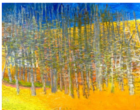
Work by Wolf Kahn

Kahn has been honored with numerous awards, including both Fulbright and Guggenheim Fellowships. He is an elected member of the National Academy of Design, the American Academy and