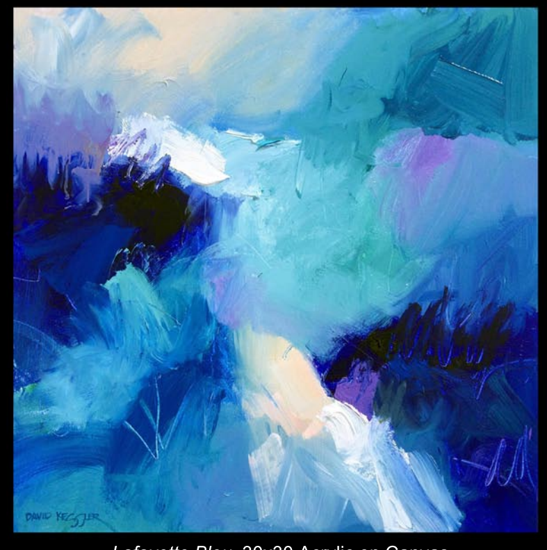
Lafayette Bleu, 30x30 Acrylic on Canvas

Residential and Corporate Commissions "Loosen-Up" Abstract Painting Workshops "Loosen-Up" Watercolor Painting Workshops