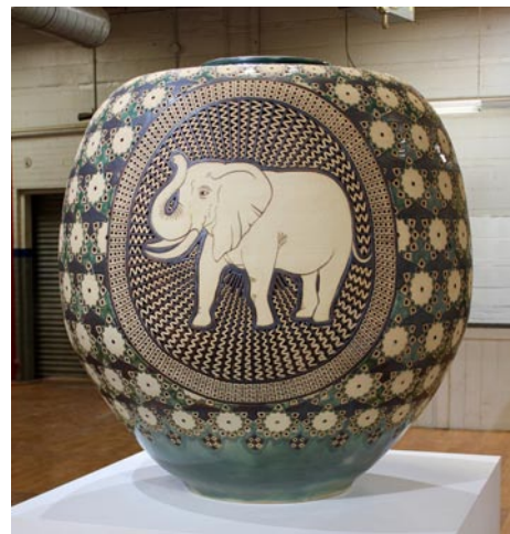
Work by Ibrahim Said

Said's carvings are derived from Islamic jug filter designs, which were both functional and aesthetic. The filters were often built within the neck of the jug to filter impurities from the Nile River. The jug filters during the Fatimid Era (909 – 1171) featured beautiful floral, geometric, organic and calligraphic patterns. Said researched these filters and incorporated