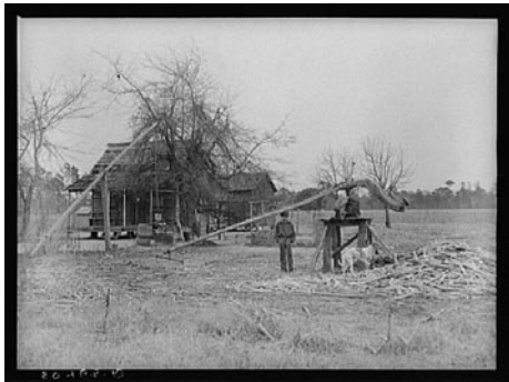
Wassamasaw Tribe of Varnertown Indians

For further information check our SC Institutional Gallery listing, call the Center at 803/313- 71721 or visit ( www.sc.edu/Lancaster/nativeamericanstudiescenter ).