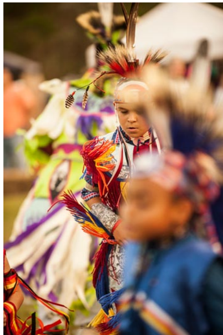
Stunning photos document powwow dancers, regalia and more in this photographic exhibit of South Carolina's Indigenous celebrations.

The Wassamasaw Tribe of Varnertown Indians is a Native American community located on highway 17-A between the towns of Moncks Corner and Summerville near Carnes Crossroads in South Carolina. This community resides in Berkeley County, which at one time stretched from St. James, Goose Creek Parish to St. John's Parish. They have been known by different names, the most common are Varnertown Indians and Summerville Indians. Currently, they have over 1500 documented bloodline descendants with over 200 years of history.