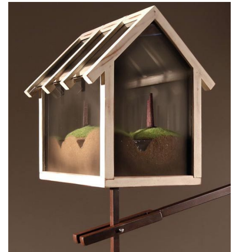
Work by Jonathan Pellitteri

display this spring in the third and final iteration of this popular exhibition. View the exhibit virtually at ( http://mckissick.uofsccreate.org/exhibitions/quilts/ ). Ongoing - "Highlights from the Permanent Collections of McKissick Museum". Permanent - "Baruch Silver Collection," a collection of the Baruch family silver. And, "Natural Curiosity: USC and the Evolution of Scientific Inquiry into the Natural World". Hours: Mon.-Fri., 8:30am-5pm & Sat., 11am-3pm. Contact: 803/777-7251 or at ( http://artsandsciences.sc.edu/mcks/ ).