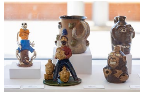
Face Jugs from the Gorelick Family Collection