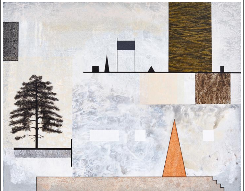
Folded #1, 2021, Acrylic on Canvas, 16 x 20 inches