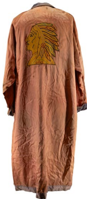
A robe in the "sov-er-ign-ty" exhibition

about 300. Hours: open daily, year round, with seasonal hours. Contact: 828/497-3103 or at ( www.cherokee-nc.com ).