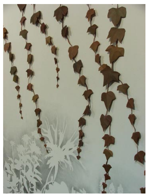
Work by April Flanders

Catwalk Community Gallery, Through June 4 - "Beyond Their Natural Range: April Flanders". Printmaker April Flanders' current work addresses the uncontrollable nature of invasive botanical species in the Appalachian region, influenced by humankind's fascination with the exotic, and perhaps driven by the need for individuality. The exhibit reveals the result of this obsession as an unnatural, globalized landscape that means an inexorable death for native species. Mezzanine Gallery, Through June 4 - "8th Appalachian Mountain Photography Competition". The Competition (AMPC) is a program of Appalachian's Outdoor Programs in partnership with the Blue Ridge Parkway Foundation and the Turchin Center for the Visual Arts. The AMPC has become a prominent regional competition, attracting the work of amateur and professional photographers from across the country and allowing them the opportunity to celebrate the unique people, places and pursuits that distinguish the Southern Appalachian mountains. Categories for photographic submissions include: Adventure, Blue Ridge Parkway Vista, Share the Journey, Culture, Environment, Flora/Fauna and Landscape. Hours: 10am-6pm, Tue., Wed., Thur., & Sat. and Fri..noon -8pm. Contact: Hank T. Foreman at 828/262-3017 or at (www.turchincenter.org).