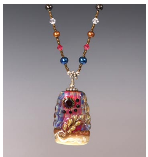
Work by Tammy Rudd

The shows will again include our popular silent auctions. The auctions feature craft objects donated by our participating artists and by members of Charleston Crafts Cooperative. Each show will feature a separate silent auction selection.