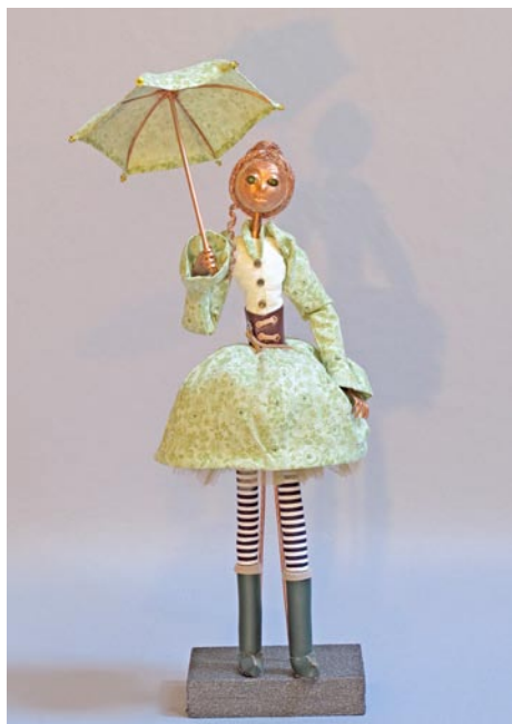
Work by Lynn Wartski

Lynn Wartski adds whimsy to the show with the unique doll sculptures for which she is increasingly well-known. Says Wartski, "My art doll sculptures test the