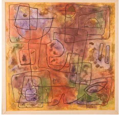
Work by William Halsey

The South Carolina State Museum in Columbia, SC, is presenting Halsey 100, on view through Sept. 7, 2015. The exhibition examines the work of an important