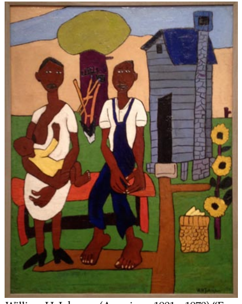
William H. Johnson (American, 1901 – 1970) "Evening" oil on burlap, ca. 1941

The Bechtler Museum of Modern Art in Charlotte, NC, is presenting The Art Books of Henri Matisse , on view on the Museum's Fourth-Floor Gallery, through Sept. 7, 2015. The Bechtler Museum of Modern Art is featuring an exhibition of art books by one of the greatest artists of the 20th century, Henri Matisse (1869-1954). Drawn from the Bank of America Collection, the exhibition includes 80 framed original illustrations with text from some of Matisse's most significant books. For further information call the Museum at 704/353-9200 or visit (www.bechtler.org).