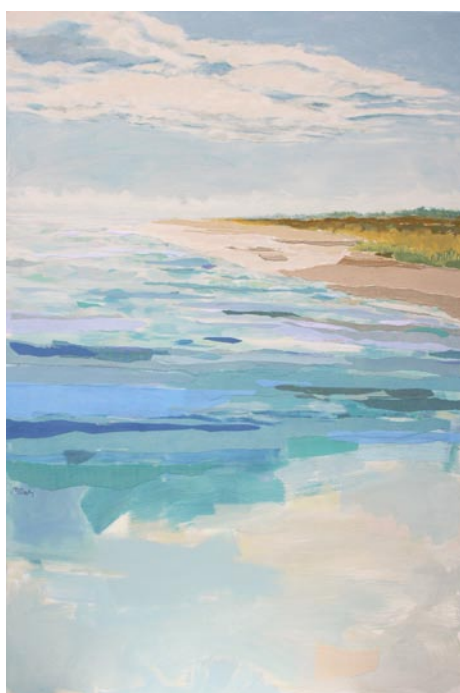
Work by Karin Olah

Continuing the series of works “that contemplate the seam where ocean meets sky,” Olah explores the “metaphorical connections between fabric and subject