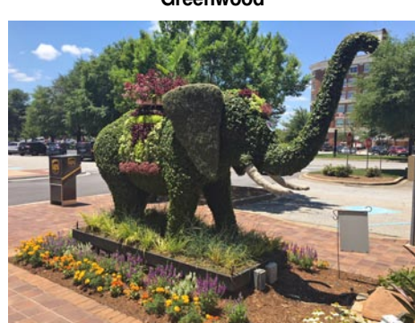
One of the major Topiaries on view

Landscaped areas in Uptown Greenwood, June 1 - 6. 2018 - "Signature Topiaries". When it comes to flowers, everyone loves the topiaries—from the majestic elephant to the dabbling ducks to the Safari Jeep. You will be astonished to see the variety of sculpture sizes, plants, colors and textures. In all, 46 unique "living" creations are uniquely set in landscaped areas in Uptown Greenwood during the 51st Anniversary of the SC Festival of Flowers. Contact: (www.scfestivalofflowers.org).