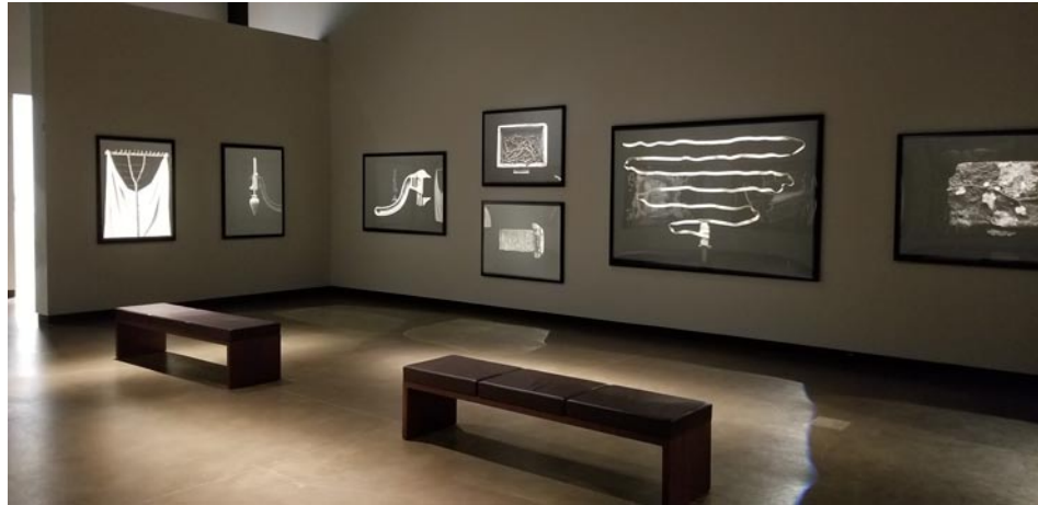
View from the exhibit, "Objects of Intentions - Photographs by Stephen Althouse"

NC State University in Raleigh, NC, is presenting Object of Intentions – Photographs by Stephen Althouse , on view in the Black-Sanderson Gallery, of the Gregg Museum of Art & Design, through May 9, 2021.