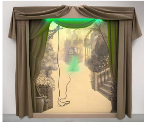
Minoo Emami, Iranian, born 1963, "Andaruni", 2021, acrylic on canvas, projected video, fabric, fluorescent light, and wood support, 84 x 120 x 10 inches. Lent by the artist.