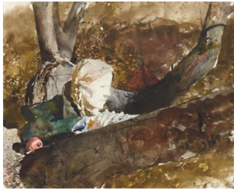
Andrew Wyeth, 1917 - 2009, "In the Orchard", 1973

Throughout his lengthy and prolific career, Wyeth focused on two locations: