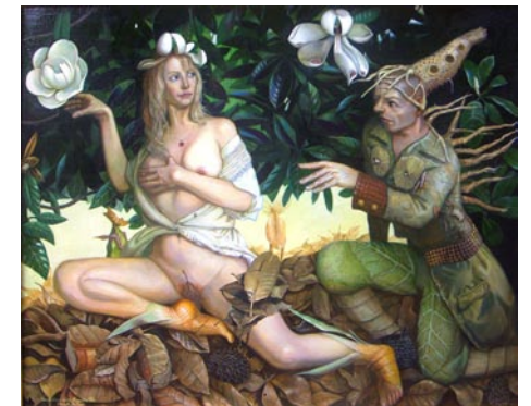
Work by Henryk Fantazos

Charlotte Russell Contemporary Fine Art Gallery , 2012 A Fairview Road, Five Points area, Raleigh. Ongoing - Charlotte Russell Contemporary Fine Art Gallery offers original artworks by emerging and mid-career artists in our newly opened art gallery. Hours: Wed.-Sat., 11am-4pm or by appt. Contact: 415/601-0023 or at ( www.charlotterussellcontemporary.com ).