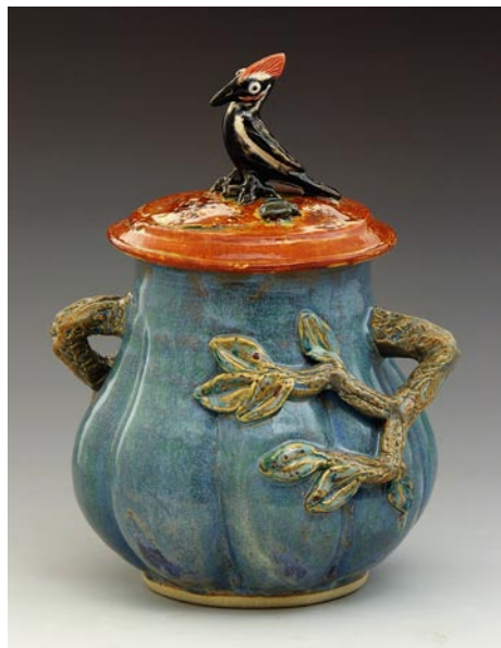
Work from Turtle Island Pottery

Village Craftsmen , 170 Howard Street, Ocracoke Island. Ongoing - We feature pottery, glass, jewelry, kitchen items, musical instruments, wrought iron, baskets, bells, boxes, soaps, accessories, clothes, games, kaleidoscopes, lawn sprinklers, lamps & lampshades, prints, tin ware, pewter items, tiles and much more - all made by American artists. Hours: Mon.-Sat., 10am-4pm & Sun., 10am-2pm. Contact: 252-928-5541 or at ( www.villagecraftsmen.com ).