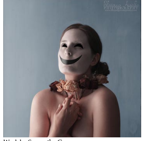
Work by Samantha Goss

Mental Health Moonshot is a group exhibition that beckons us to embark on a monumental journey aimed at unraveling the complexities of mental health and dismantling the barriers of stigma. Through paintings, photography, drawings, and mixed media, the exhibition delves into the triumphs and tribulations of individuals grappling with mental health conditions. Walt's Waltz in partnership with GCCA is committed to erasing stigmas and reducing suffering as they work as a catalyst for change. With a dual-fold theme of hope and resilience, the exhibition becomes a beacon of hope piercing the darkness of mental health struggles