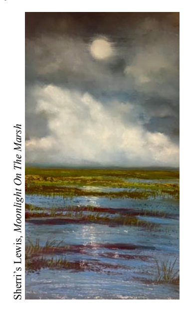
James Island Arts & Cultural Center 1248 Camp Road James Island, SC 29412 MWF 9-5, T/Th 10-6, Sat 12-5

"Through our Members' Eyes" Member Entry closes midnight, May 19 ARTWORK DELIVERY MAY 28, 10-12PM EXHIBIT OPENS JUNE 1 Member/Signature Awards RECEPTION JUNE 29. JAMES ISLAND ART AND CULTURE CENTER JUDGED BY EVE MILLER, PSA, IAPS-MC