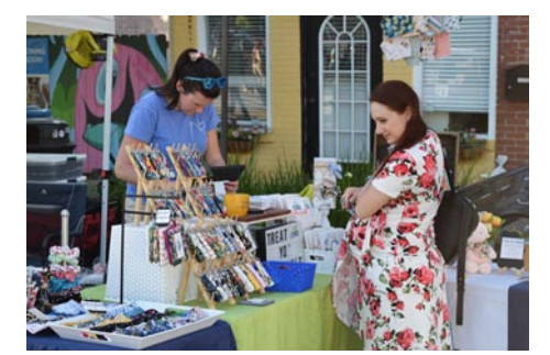
View of an Arty Block Party vendor