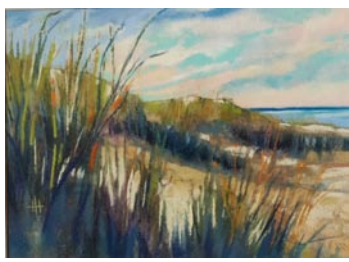
Hollis Hill, Last Day of Summer

www.pastelsocietyofsc.com for details pastelsocietyofsc@gmail.com to pay