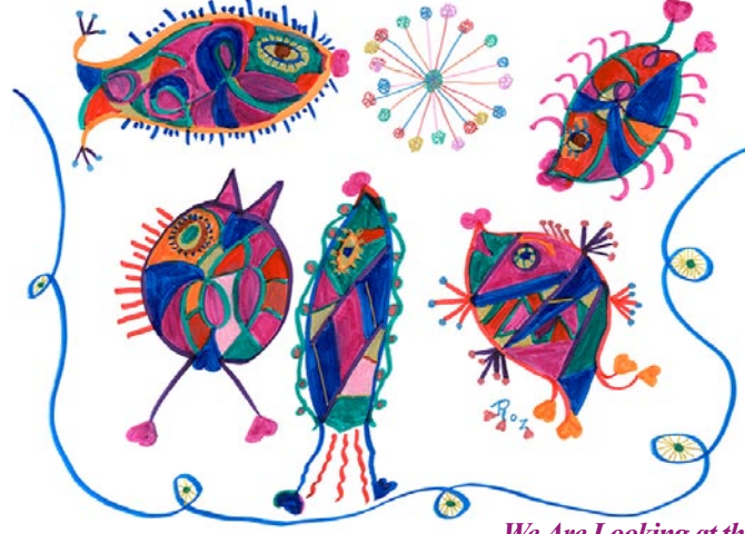
We Are Looking at the Starburst