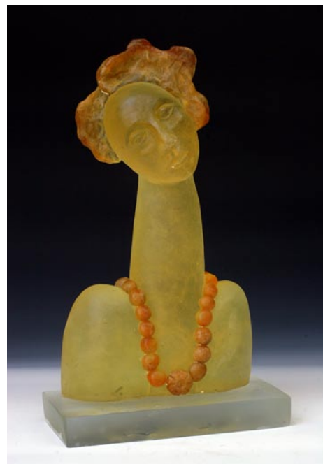
Cast glass sculpture by Jan Kransberger, on view at the Upstairs Artspace in Tryon, NC

The Mint Museum of Craft + Design, housed in the Mint Museum Uptown in Charlotte, NC, collects international studio craft and design in the areas of glass, fiber art, metal, studio jewelry, design, studio furniture, wood art, and clay. The collection celebrates exceptional moments of artistic and design excellence. The new facility in Center City Charlotte offers an incredible opportunity to exhibit more of the Museum's permanent collection with expanded exhibition space.