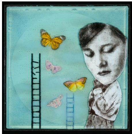
Michael Janis, That I Might Fly Away , kiln cast glass, glass powder imagery, steel, 12-1/2" h x 12-1/2" w. On view at Blue Spiral 1 in Asheville, NC.

For further information check our NC Institutional and Commercial Gallery listings, call 828/433-7282 or visit ( www.downtownmorganton.com ).