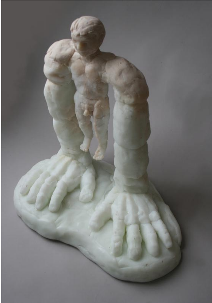
Robert Bender, Totem , cast glass, 15"H x 10"W x 7"D. On view at Blue Spiral 1 in Asheville, NC.

Born of Fire: Glass from the Museum's Luski Collection , featuring works of glass given to the Museum by Sonia and Isaac Luski, and Rose and Abraham Luski. Several styles of glass blowing are demonstrated and the show includes artists from the prestigious Penland School of Crafts nestled in the Blue Ridge Mountains of North Carolina.