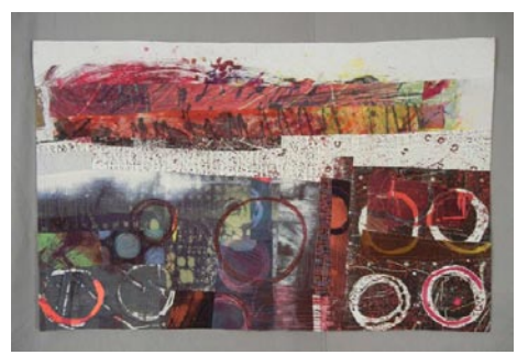
Work by Pat Pauly

RIVERWORKS Gallery is operated by and for the faculty and students of the Department of Visual and Performing Arts at Greenville Technical College. The gallery is located along the scenic Reedy River at