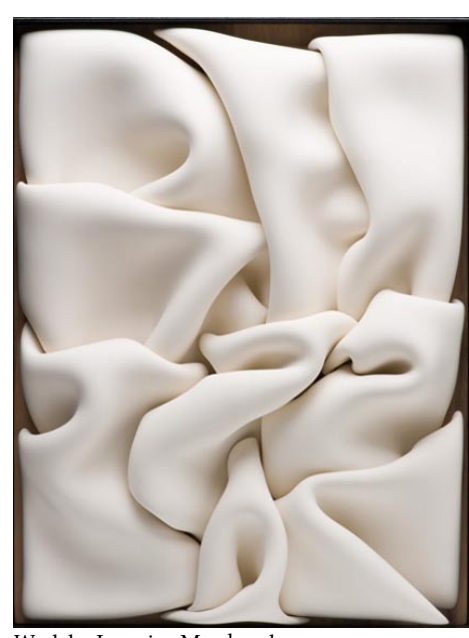
Work by Jeannine Marchand

LaCa Projects opened on March 21, 2013 with poetics of erratic materialism, a solo exhibition featuring the works of pop-surrealist artist Juan Dolhare (Argentina). Located in the heart of the revitalized FreeMoreWest neighborhood, LaCa