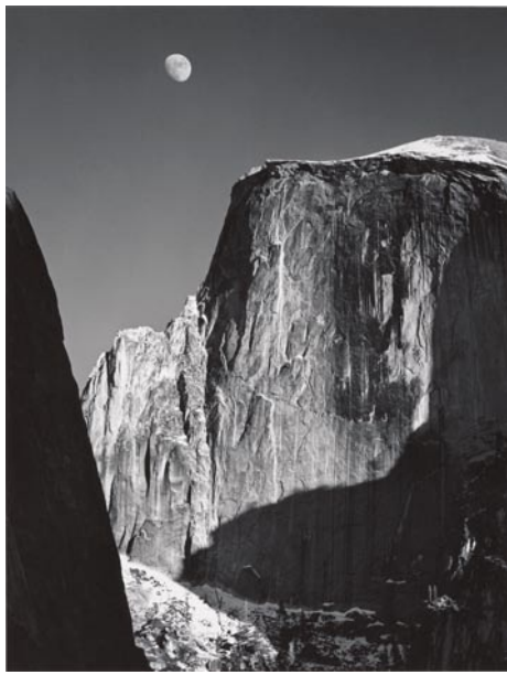
Moon and Half Dome, Photograph by Ansel Adams.