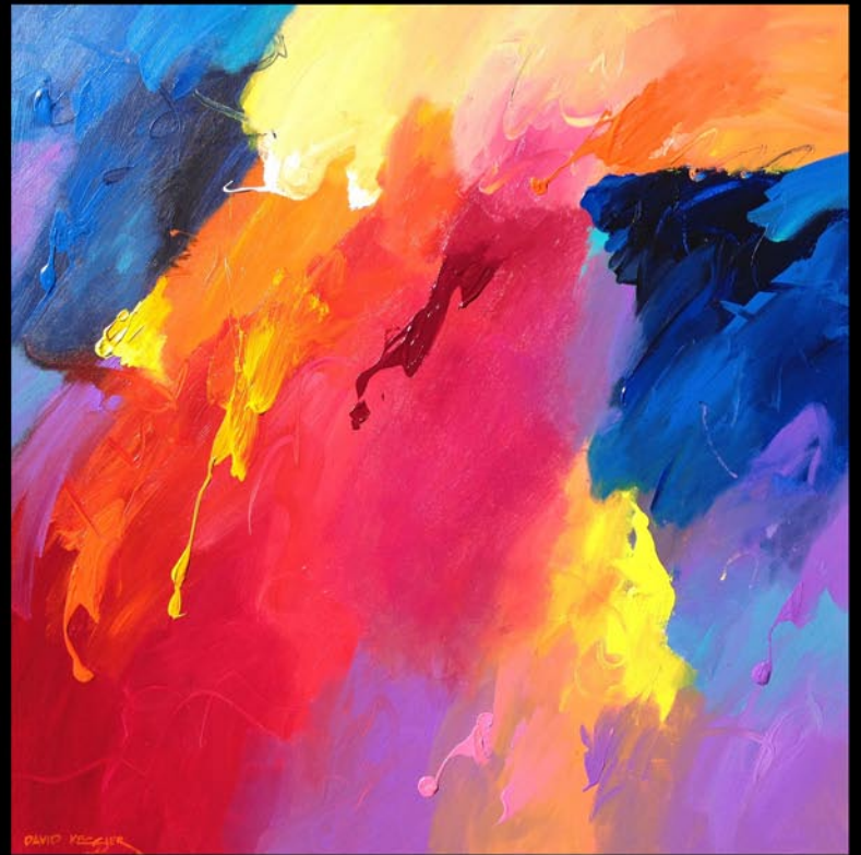
Midnight Sun 2 , 48x48 Acrylic on Canvas