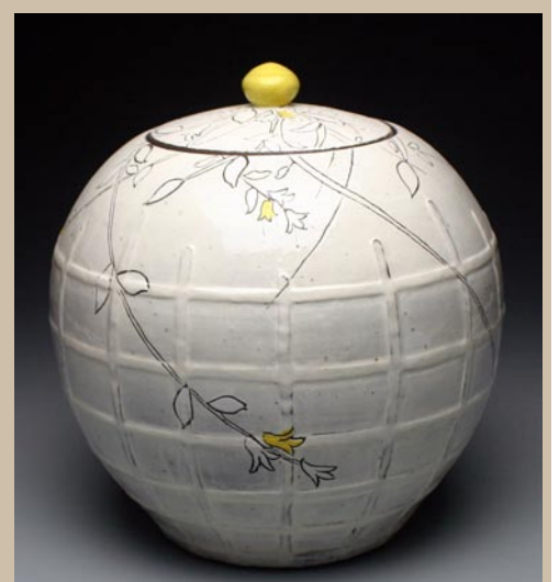
Work by Ben Carter

If you like what you hear you might want to sign up for the newsletter. To join the list click the following link and sign up in the box below the streaming player: ( http://www.carterpottery.blogspot.com/2009/05/welcome-to-tales-of-red-clay-rambler.html ).