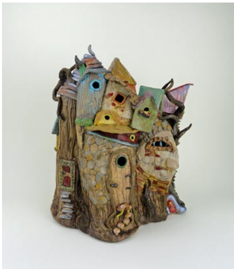
Work by Marty Allran

Since opening in 2002, Sunset River Marketplace has been an active supporter of performing, literary and visual arts in the area. The 10,000 square-foot gallery features work by over 200 North and South Carolina artists. Its on-site pottery studio has two kilns and three wheels for use by students. Ongoing oil, pastel and watercolor classes are also provided, in addition to workshops by nationally known artists. The gallery's complimentary Coffee With the Authors programs feature presentations by local and regional authors. A Paint & Party series provides a fun after-work experience for those with no previous art background. The gallery's framing department offers full-service, on-site custom frame design for artwork, family heirlooms and other memorabilia.