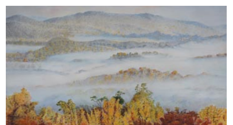
Work by Al Junek

The exhibition will feature Junek's focus on the atmospheric landscape of mist, fog, or colorful skies so typical of the weather systems found in our mountain area. "I try to share the beauty of a particular place or moment in a way that will transport viewers to that spot so they can experience much the same sights or feelings that moved me to