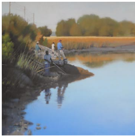
Work by Todd Baxter

Compass Prep Student Photo Exhibit will be on exhibition concurrently in the Edmund Lewandowski Classroom Gallery.