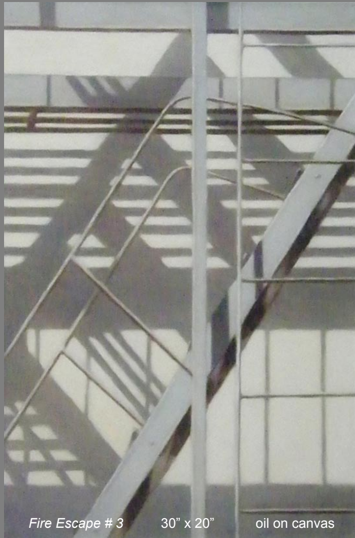
Fire Escape # 3 30" x 20" oil on canvas