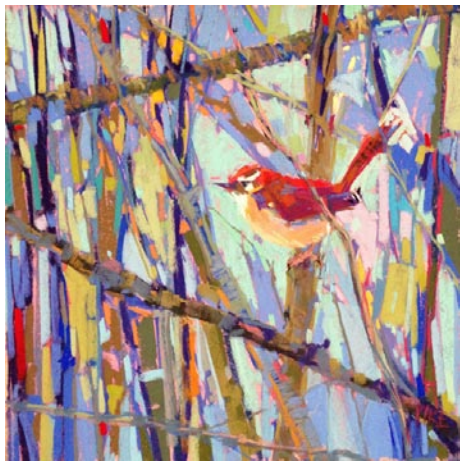
Work by Dianne Pike

For further information check our NC Institutional Gallery listings, call the Museum at 828/327-8576 or visit ( www.HickoryArt.org ).