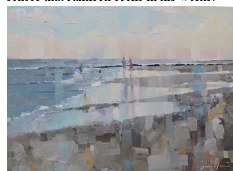
Work by Jeff Jamison

The gallery is thrilled to invite you to escape into Jamison's timeless realm of long-lost lovers as they reunite in dreamlike cities, cozily tucked beneath the glow of a umbrella. You might feel the urge to suddenly ride your bicycle along a sunny side street in Charleston, or your breath might catch at the sight of couples waltzing in a luxurious ballroom. All of this is normal, in fact, it is the provocation of the senses that Jamison seeks in his works.