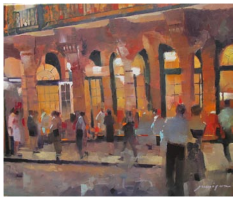
Work by Jeff Jamison

One of the top-selling artists at the gallery, Jamison imbues a combination of nostalgia and timelessness into his paintings through use of a contemporary style. This might seem paradoxical, and perhaps it is, but it is what makes his works so enigmatic. They are beautiful and mysterious, light and carefree and above all, they invite you to participate with your imagination. The cities Jamison features might appear to be New York or Paris, but look close! They are in fact the cities of his dreams - mashups of places he has been and places he has yet to visit. Because of the ambiguity of people and places, Jamison's works offer something Page 8 - Carolina Arts, June 2016