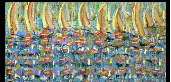
Ann Parks McCray, Island Hopping, oil, 12" x 24"