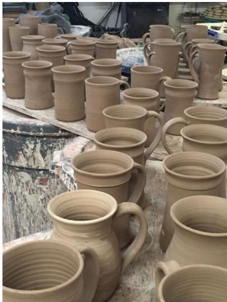
Mugs waiting to be glazed and fired

For further information visit ( http://discoverseagrove.com/saturdays-in-seagrove/ ) or ( http://www.facebook.com/seagrovepotters ).