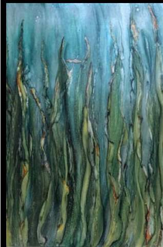
Anne Cunningham, Water Meditation, galvanized steel, 36" x 24"